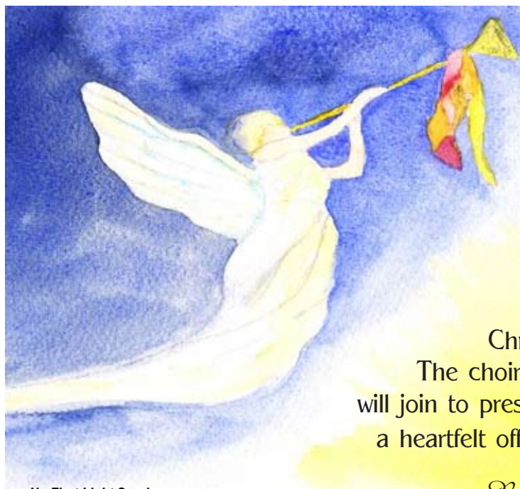
No First Light Service.